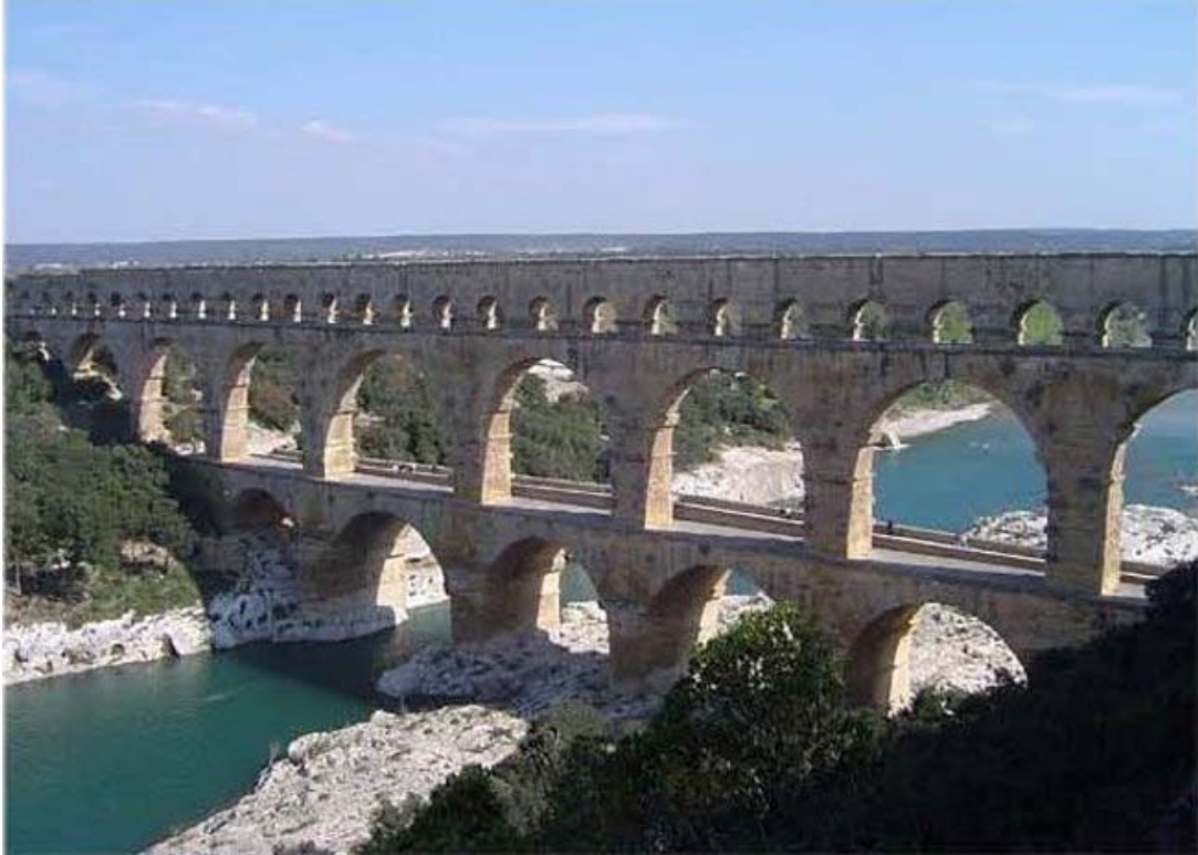
Figure 2: Roman aqueduct circa 19 BC in southern France today- Pont du Gard