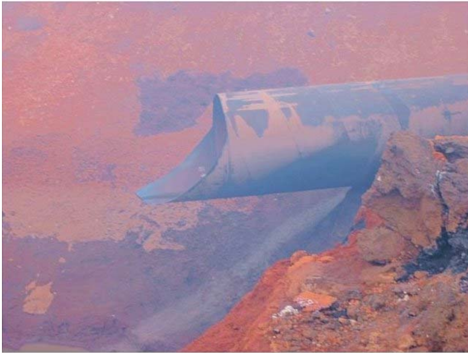
Figure 4: Stress originated piping explosion; (photo courtesy of [16])

In addition, specific analyses are performed to determine stress in complex parts of equipment or sections of piping subjected to steady state or transient loads such as pressure, thermal displacements, flow excitations, acoustic loads, and vibration loads. Piping analyses are carried out assuming linear or non-linear material behaviour, depending on the studied system's requirements and its operating conditions. There are several failure modes which could damage the piping systems.